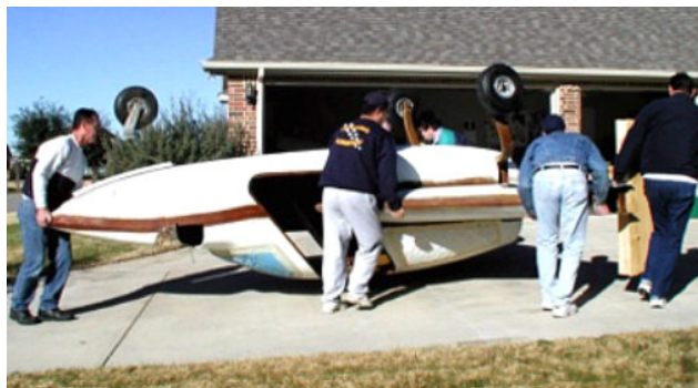
Airplane safely on its top ready for more work.