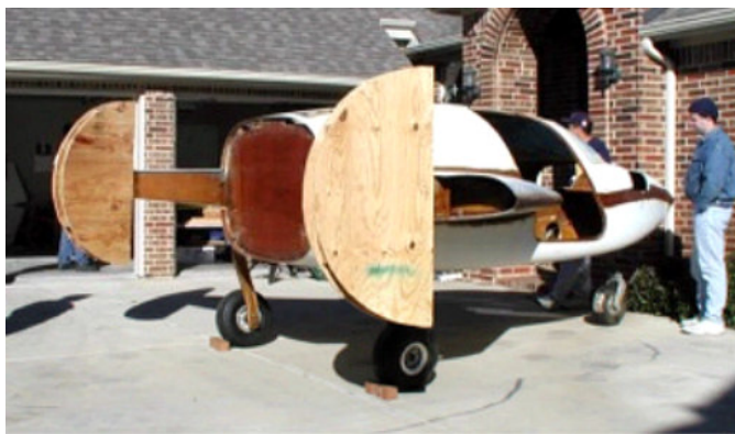
Airplane right-side-up with on-looker wondering if this thing is really going to work.