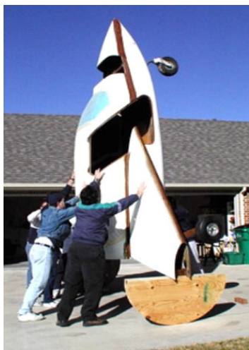
Airplane on tail-end with neighbors helping to turn and steady it.