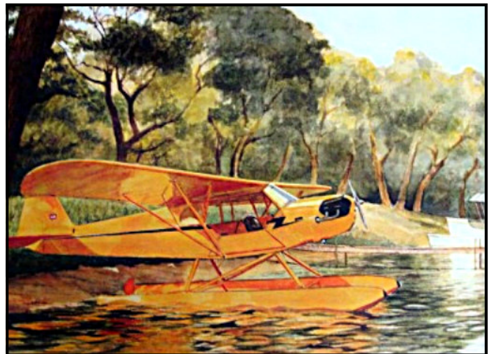
Piper Cup on Floats water color