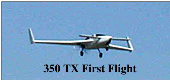
350 TX First Flight

damage was minor to the airplane and I was unhurt. This was my first off-airport landing in 45 years of flying. The culprit was a distributor gear which had stripped out due to still unknown reasons.