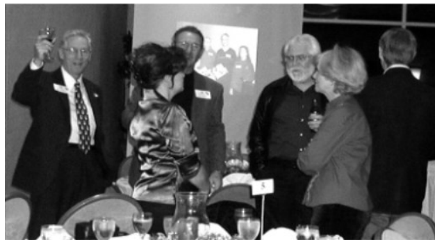
Anonymous party go-ers