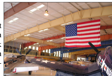
War Eagles Air Museum

This is a laid back, look at and talk planes kind of an event. The beverage truck comes out at 5 PM on both Friday and Saturday to provide additional focus to the social aspect.