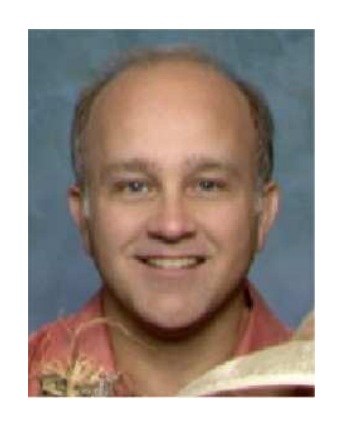
Chapter 1246 Pilot Profile