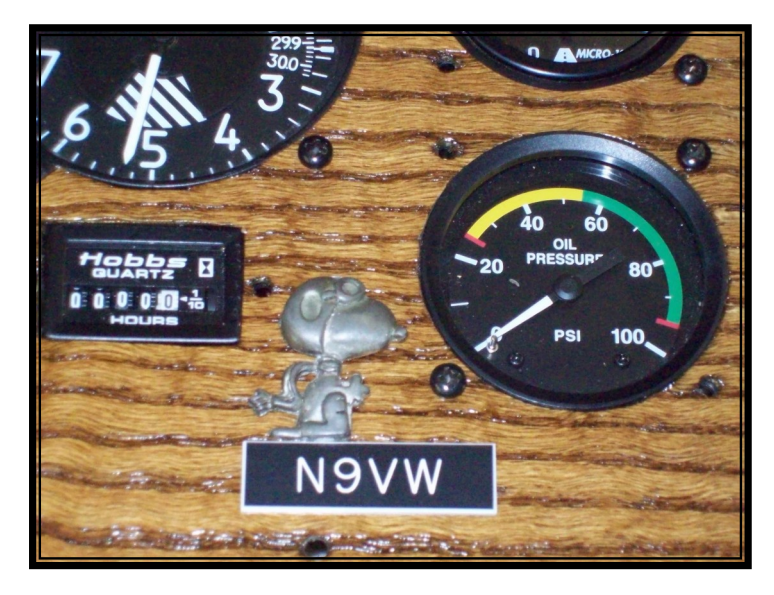
Snoopy's moving up, from headset bag to copilot.