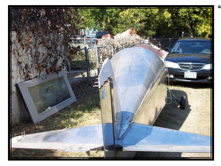
About time for a bath, and a horse power increase!