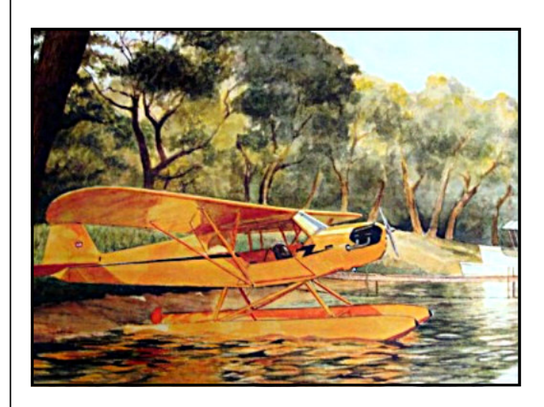
Piper Cup on Floats water color