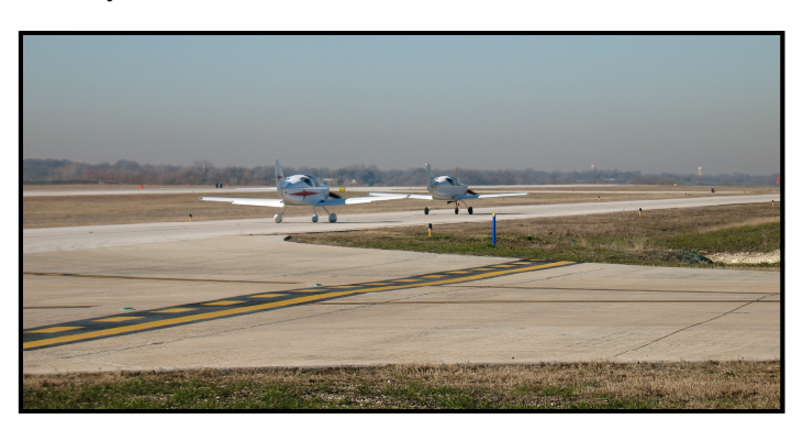
Ready for take-off, Susan in chase plane