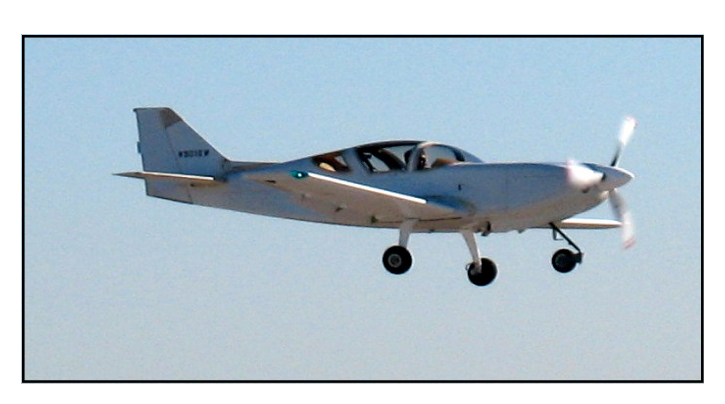
Up, up, and away!