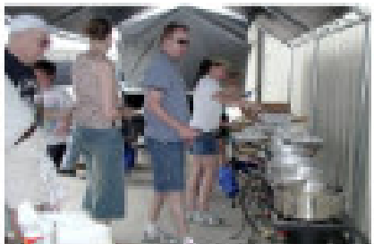
Catfish were filleted, potatoes were peeled,, and fish were fried.