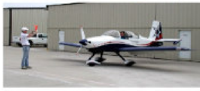
There were parkers and barkers