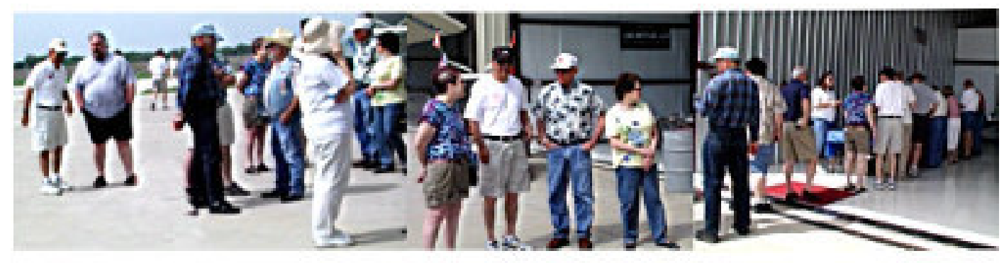
And the hungry were fed!