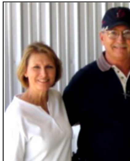
2nd Place & Peoples Choice